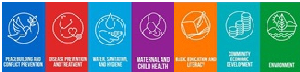
Rotary 7 Areas of Focus